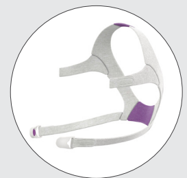
AirFit F20 for Her headgear with headgear clips 63473 (S)