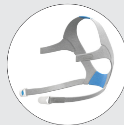
AirFit F20 headgear with headgear clips 63470 (S) 63471 (Std) 63472 (L)