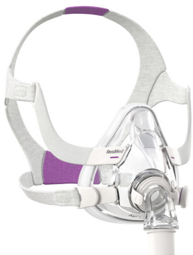
AirFit F20 for Her Designed specifically for women.

Quick-release elbow makes it simple to disconnect from the tubing without removing the mask.