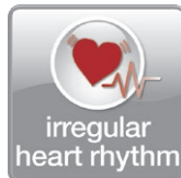
irregular heart rhythm

The integral resting indicator checks whether the patient was sufficiently relaxed when the measurement was taken and thus ensures the precision of the displayed measurement result.